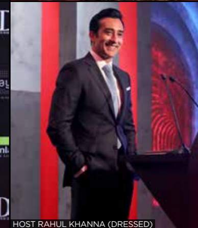
HOST RAHUL KHANNA (DRESSED)