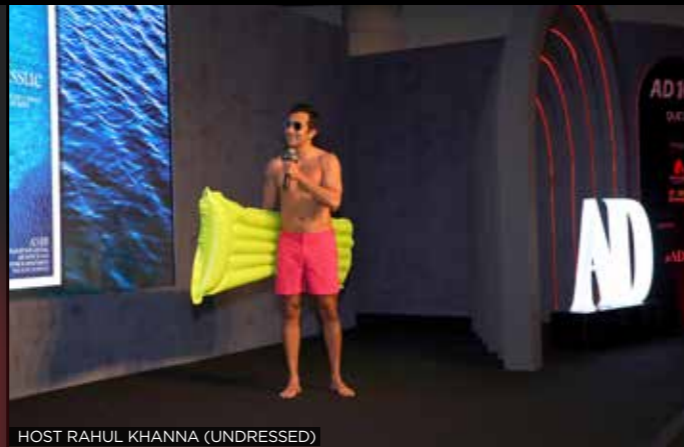
HOST RAHUL KHANNA (UNDRESSED)